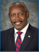
Orange County Mayor Jerry L. Demings