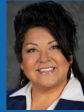
District 3 Commissioner Mayra Uribe